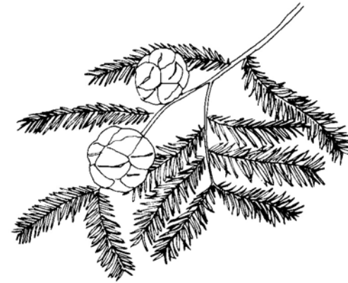
Baldcypress ( Taxodium distichum )

Baldcypress at maturity is medium sized tree reaching 50-70' with a spread of 25'. The form is pyramidal in youth, becoming flattened and broad at the top in old age. The short needle-like leaves emerge yellow-green in the spring, turning soft green in summer to reddish or orange-brown in the fall. It produces ½-1 ½" cones annually. The roots provide a haven for wildlife and the seeds are eaten by birds and animals.