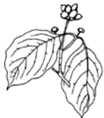
White Flowering Dogwood