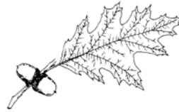
Northern Red Oak