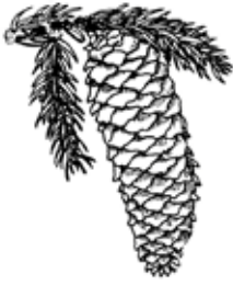
Norway Spruce ( Picea Abies ) Gold Paint