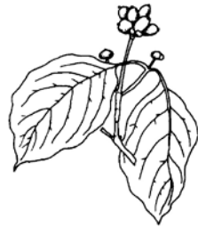
White Flowering Dogwood