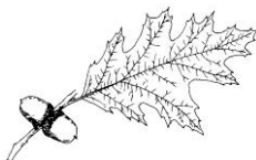
Northern Red Oak