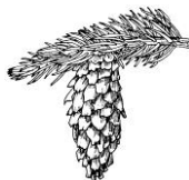
Colorado Blue Spruce